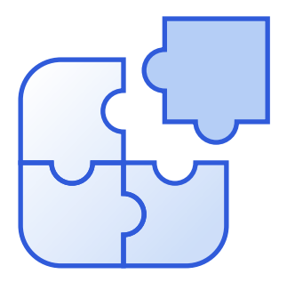
Integration with existing tools